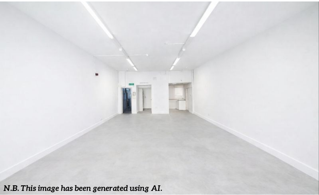
N.B. This image has been generated using AI.