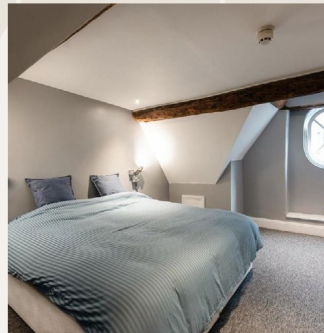
The third floor flat is comprised of 3 double rooms with a shared lounge area and a shared bathroom with a shower.