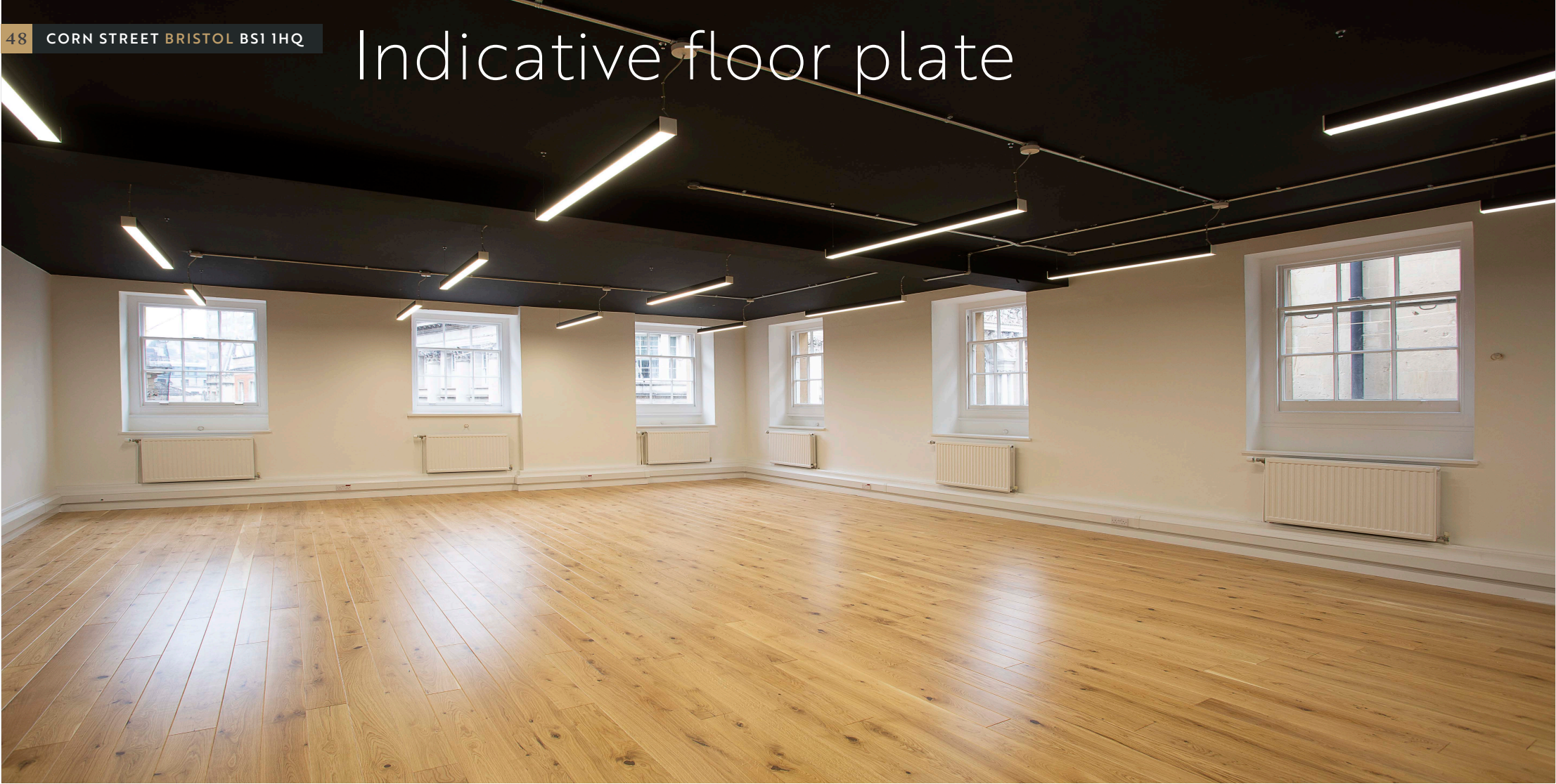
INDICATIVE FLOOR PLAN