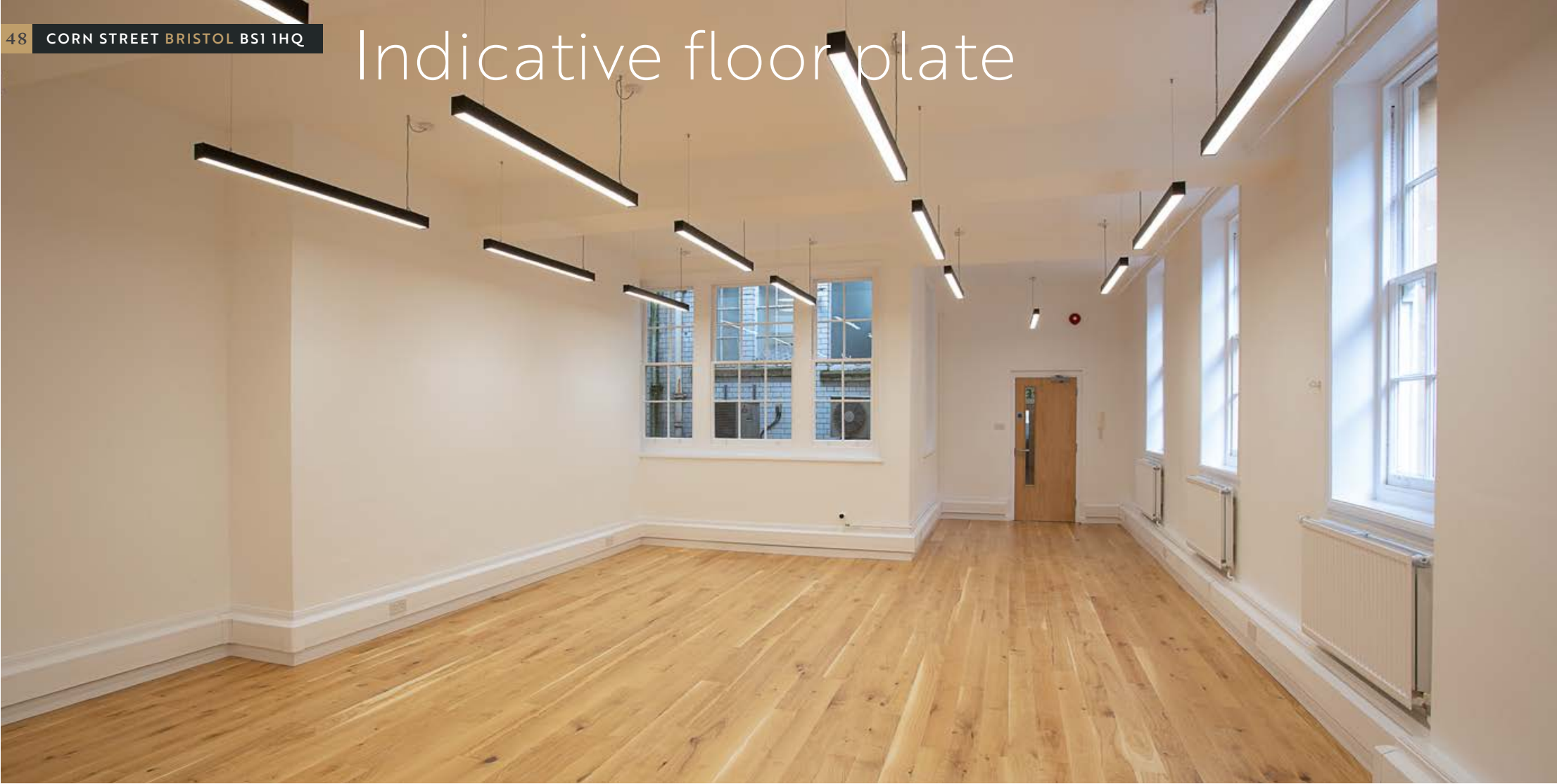
INDICATIVE FLOOR PLAN