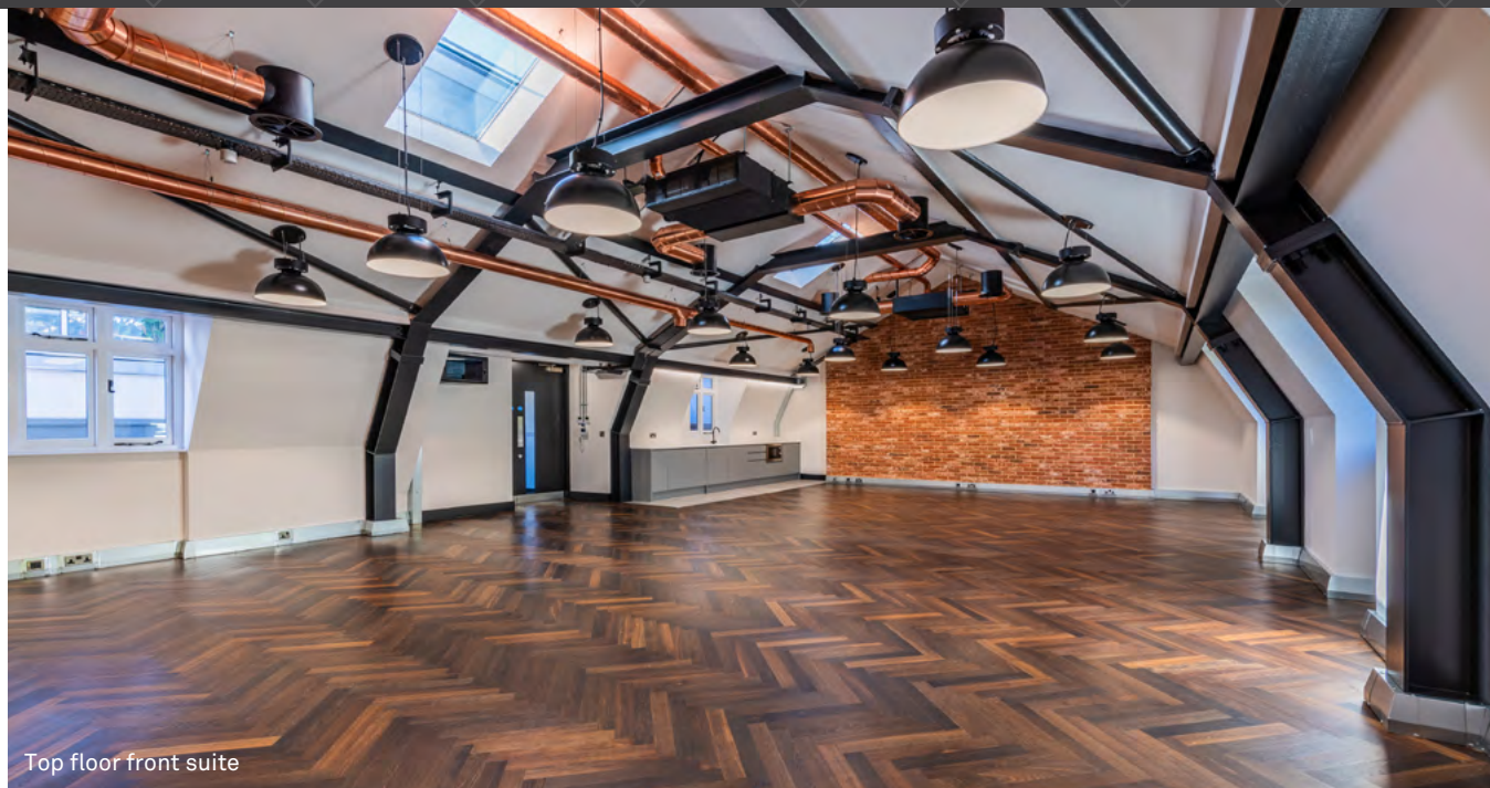
Top floor front suite