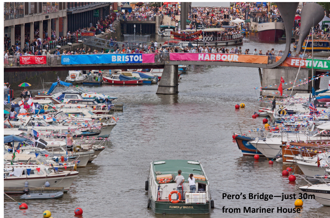
Pero's Bridge—just 30m from Mariner House