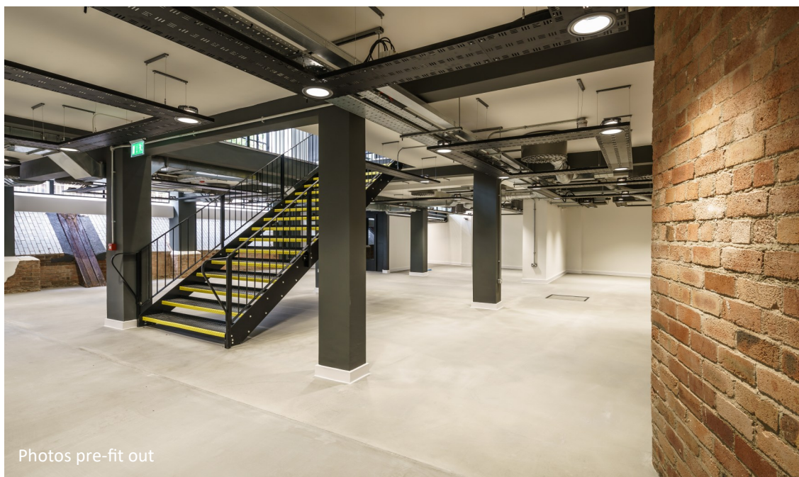
Photos pre-fit out