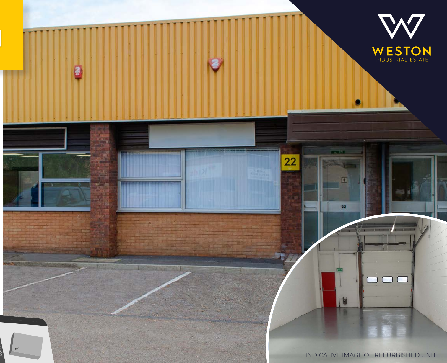
INDICATIVE IMAGE OF REFURBISHED UNIT