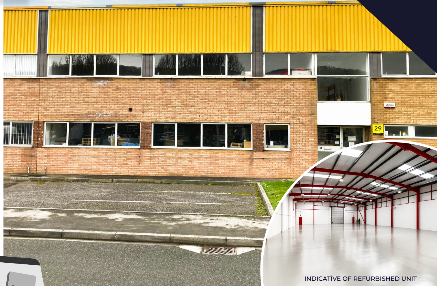
INDICATIVE OF REFURBISHED UNIT