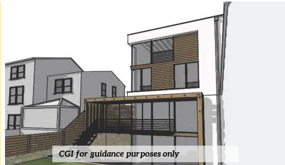
CGI for guidance purposes only

Whilst every care is taken in the preparation of these particulars, their accuracy cannot be guaranteed and no reliance should be placed on any statements or representation.