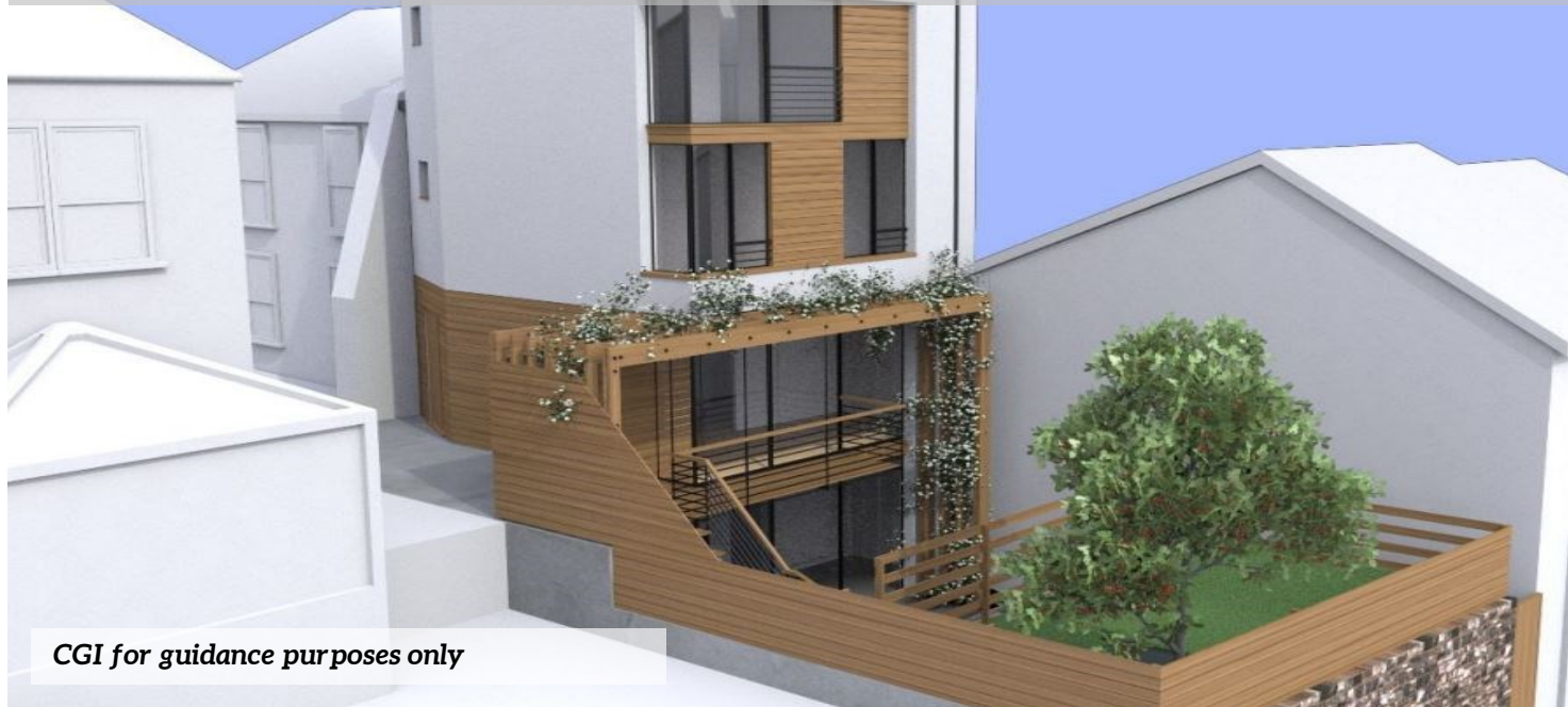
CGI for guidance purposes only

2a Southernhay Avenue, Clifton Wood, Bristol, BS8