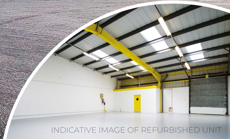
INDICATIVE IMAGE OF REFURBISHED UNIT