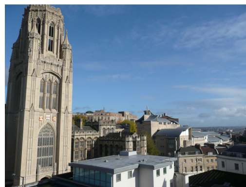
(View from Top Floor)